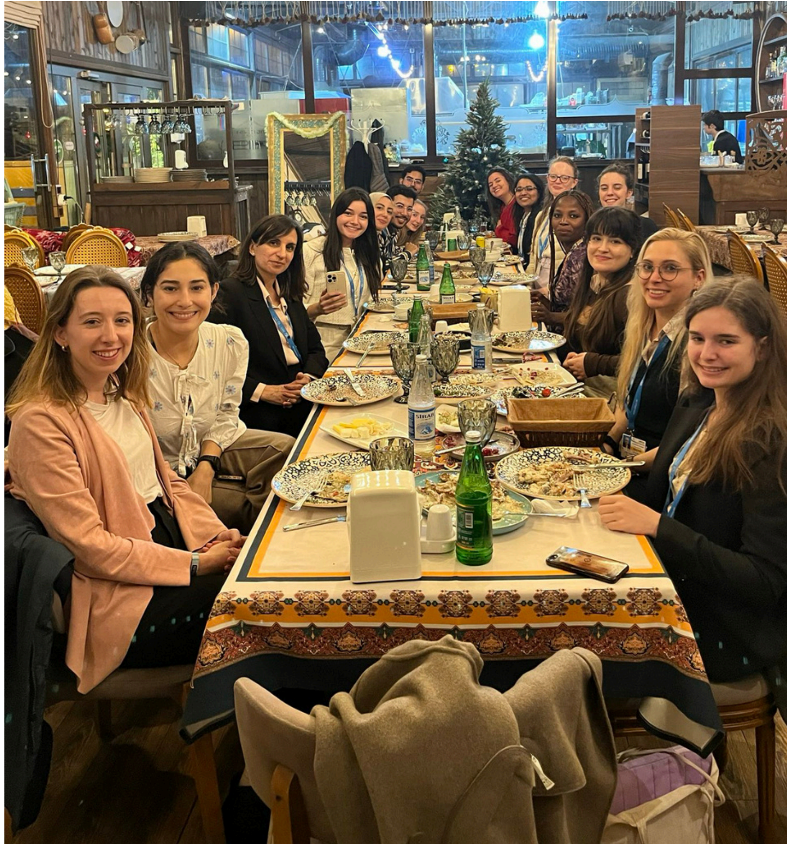
Photo: YCHN members at COP 29