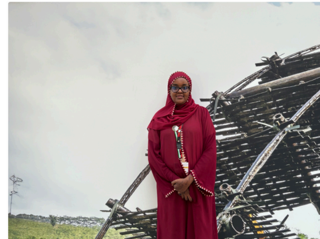
Pastoralist's daughter leads village against climate change and gender violence

By Kate Okorie Last updated: 2024/07/24 at 8:42 AM 4 Min Read